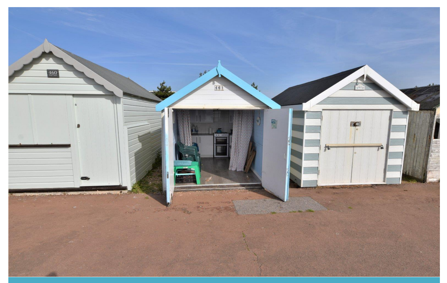
Asking Price: £55,000 Beach Hut, 461 Shoebury Common Road, Shoeburyness, Essex, SS3 9HG