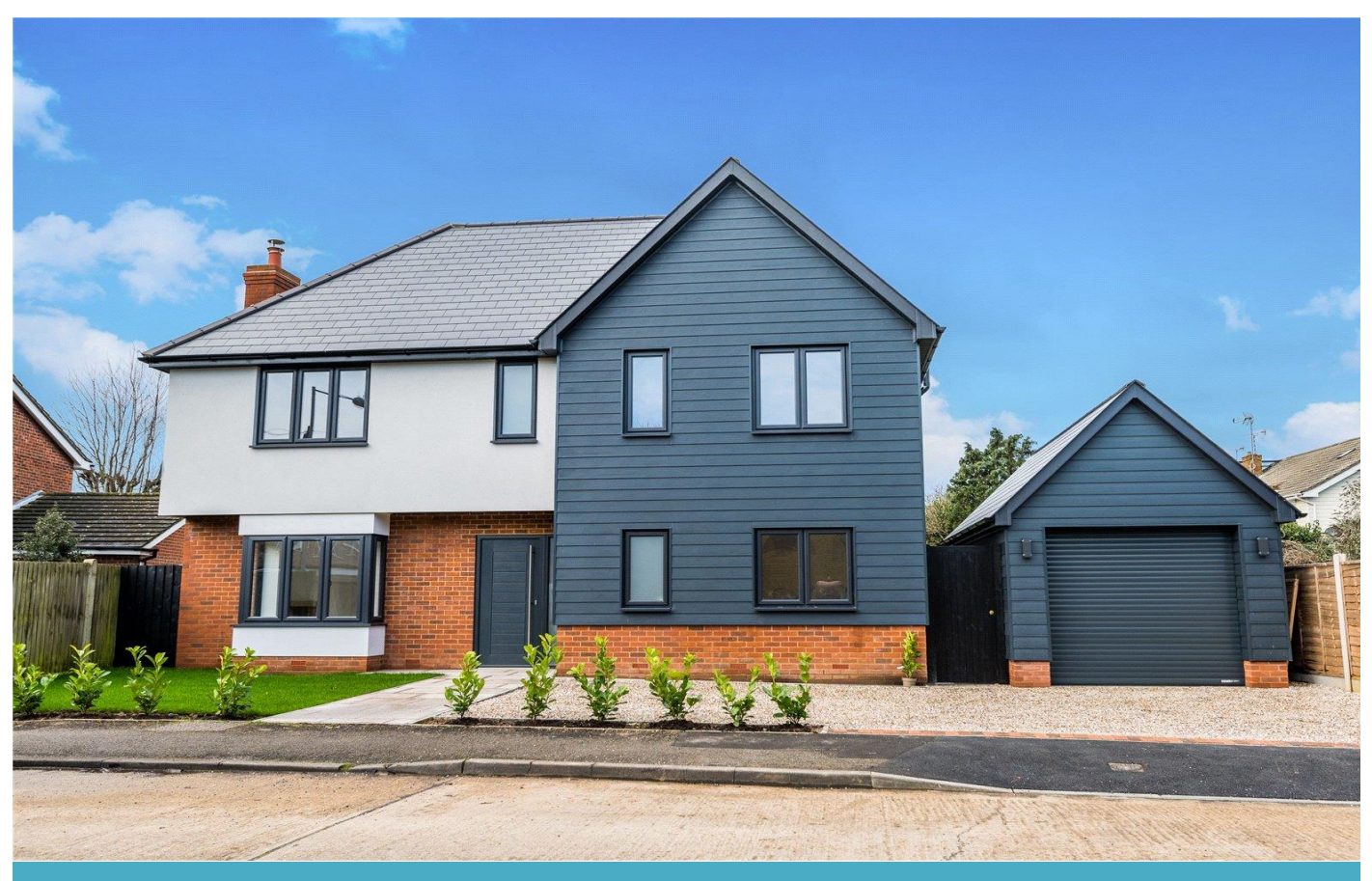
POA Holly Lodge, 8 Crouchmans Avenue, Great Wakering, SS3 0DQ